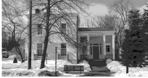
Village Hall ca 1855 (remodeled 1937)