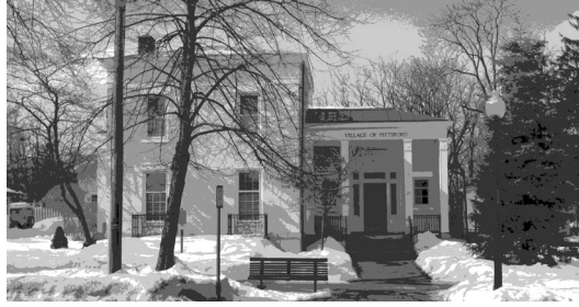
Village Hall ca 1855 (remodeled 1937)