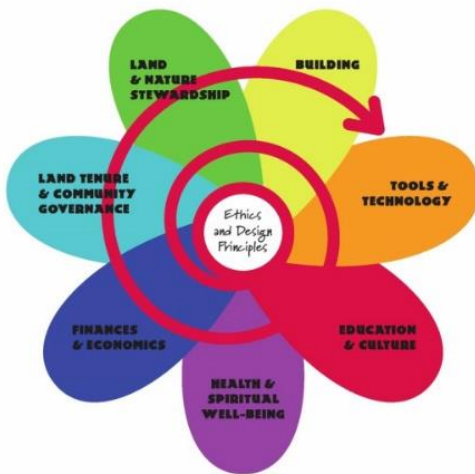
Graphic represents applying permaculture to human designed social systems as conceptualized by David Holmgren

Permaculture applications (Note: permaculture design is NOT limited to designing agricultural and horticultural systems but is also applied to urban planning, governance, economic systems, events, and more):