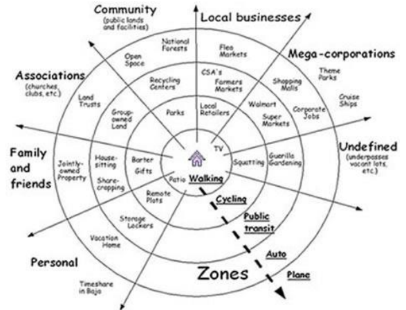
Graphic represents Permaculture Zone and Sector Design to social systems & structures