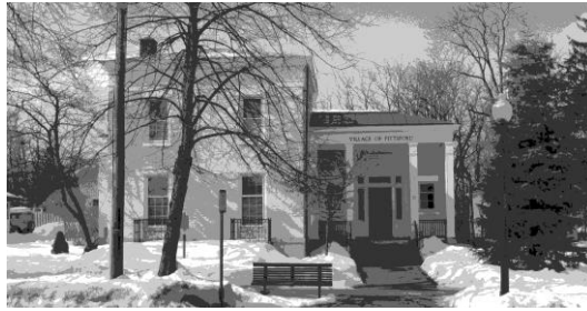
Village Hall ca 1855 (remodeled 1937)